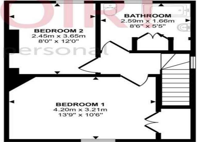
First Floor Approx 36 sq m / 389 sq ft

This floorplan is only for illustrative purposes and is not to scale. Measurements of rooms, doors, windows, and any items are approximate and no responsibility is taken for any error, omission or mis-statement. Icons of items such as bathroom suites are representations only and may not look like the real items. Made with Made Snappy 360.