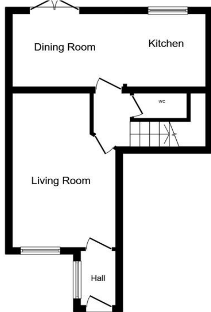
Ground Floor Floor area 36.3 sq.m. (390 sq.ft.)