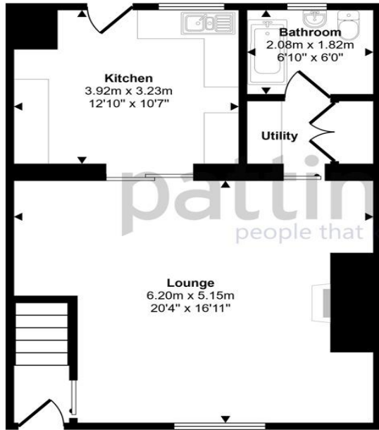
Ground Floor Approx 54 sq m / 584 sq ft

Approx Gross Internal Area 86 sq m / 922 sq ft