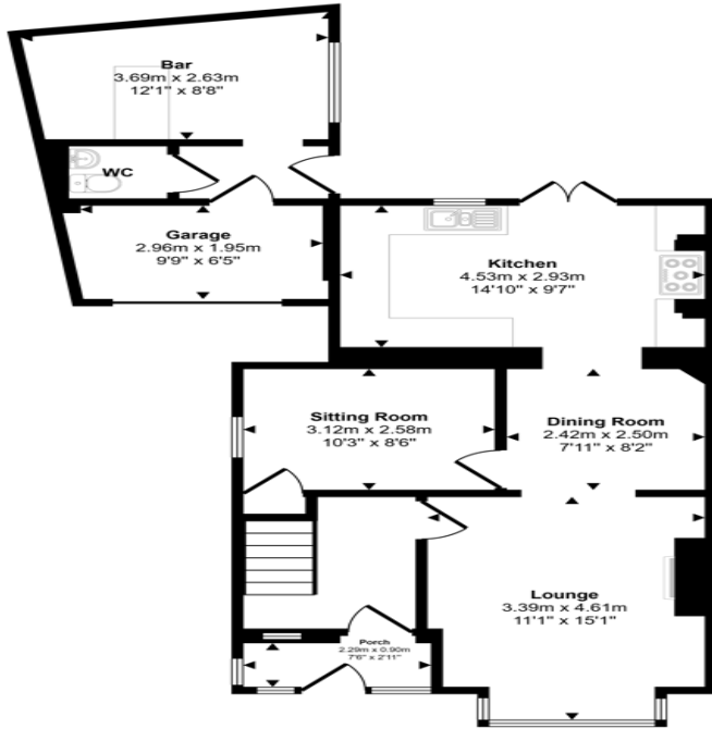
Ground Floor Approx 72 sq m / 776 sq ft

Approx Gross Internal Area 107 sq m / 1149 sq ft