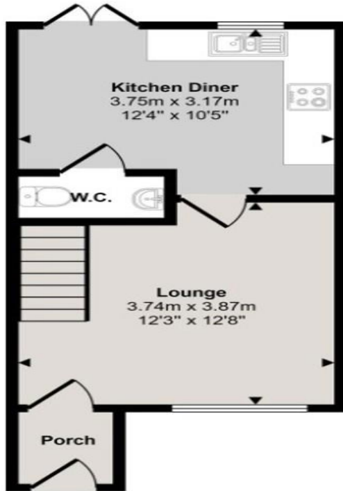
Ground Floor Approx 29 sq m / 309 sq ft

Approx Gross Internal Area 56 sq m / 605 sq ft