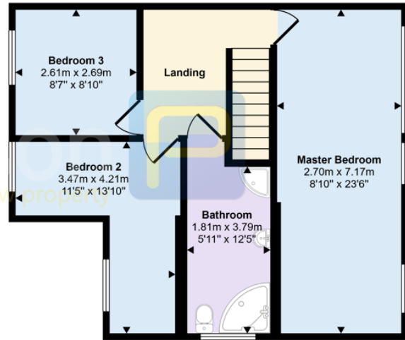
First Floor Approx 54 sq m / 583 sq ft

This floorplan is only for illustrative purposes and is not to scale. Measurements of rooms, doors, windows, and any items are approximate and no responsibility is taken for any error, omission or mis-statement. Icons of items such as bathroom suites are representations only and may not look like the real items. Made with Made Snappy 360.