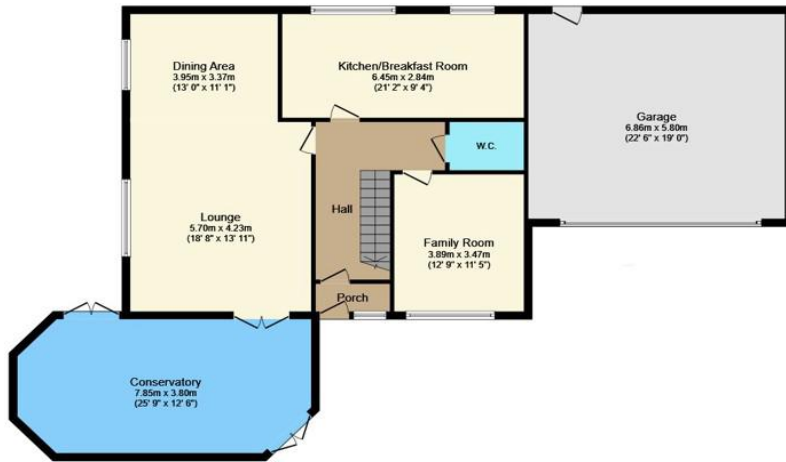
Ground Floor Floor area 157.7 sq.m. (1,698 sq.ft.)