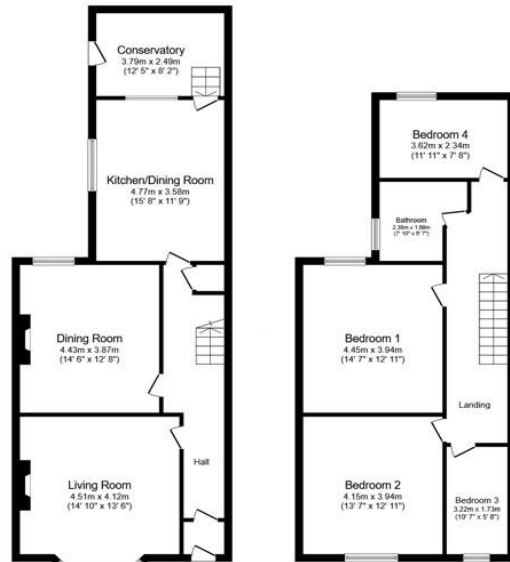
Ground Floor Floor area 78.0 sq.m. (840 sq.ft.)