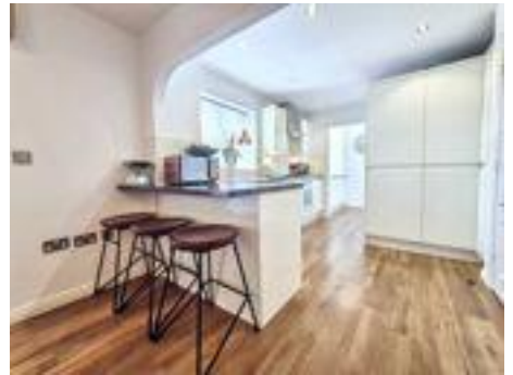
Kitchen / Diner.....